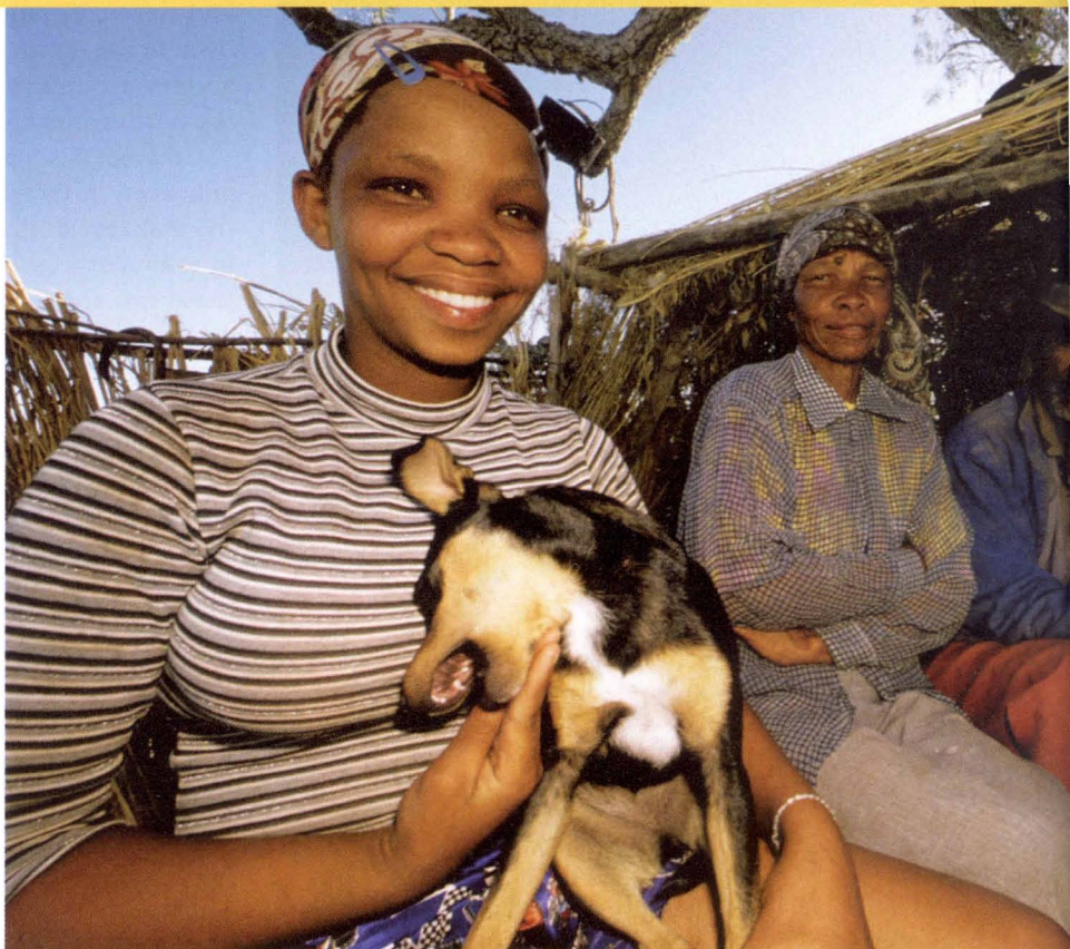
ABOVE: The Nama have been raising goats and sheep in the area's rugged desert mountains for close to two thousand years. BELOW: Map by Eco-Africa.

The idea of conserving the Richtersveld for future generations developed after members of the Eksteenfontein Youth Forum visited a petroglyph site along the Orange River in 1997. They were appalled to discover that some of them