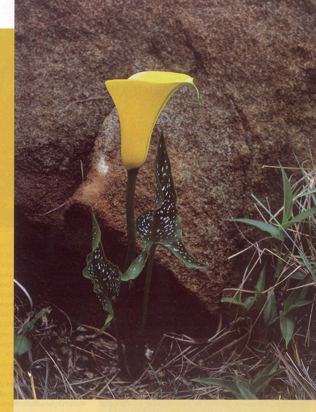
Zantedeschia jucunda benefits from human activity