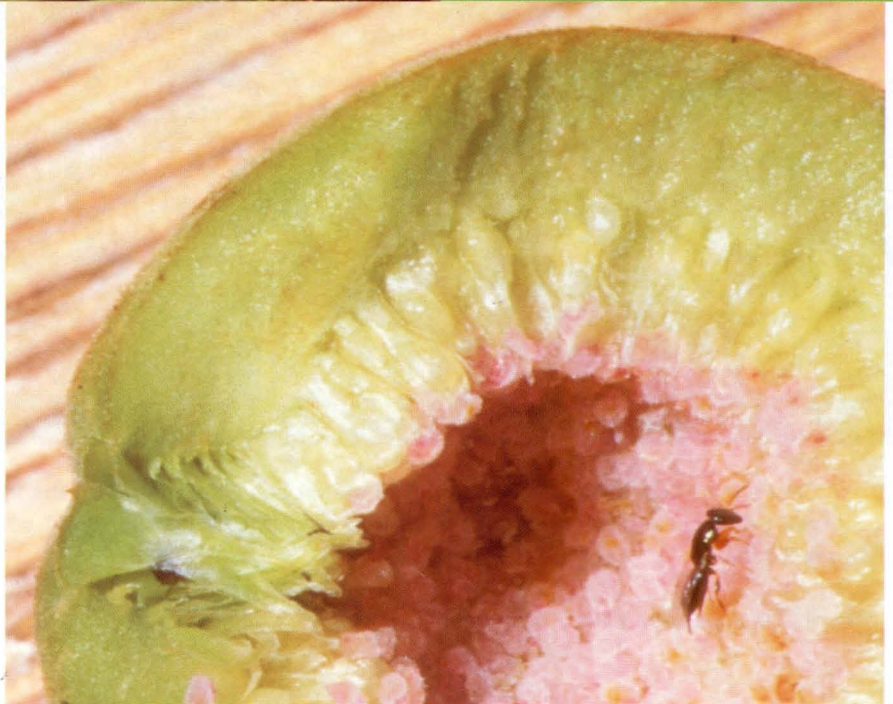
TOP: Females of the non-pollinating fig wasp, Apocrypta guineensis , laying eggs through the fig wall of Ficus sur . ABOVE LEFT: Three non-pollinating fig wasps. Philocaenus (top) enters the fig to lay eggs, Sycoryctes (centre) has a long ovipositor for laying eggs through the fig wall, and Otitesella (below) also lays eggs through the fig wall, but the ovipositor is concealed within the body. ABOVE RIGHT: Philocaenus rotundus (a non-pollinating fig wasp that enters the fig) laying eggs inside a receptive Ficus abutilifolia fig that has been split open. Photos and illustrations: Simon van Noort.

species. Fig size varies tremendously across species, from smaller than a marble to as large as a tennis ball.