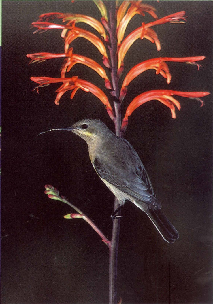
LEFT: An orange-breasted sunbird feeding on Erica bauera with the elusive violet on its throat revealed by the use of fill-in flash.