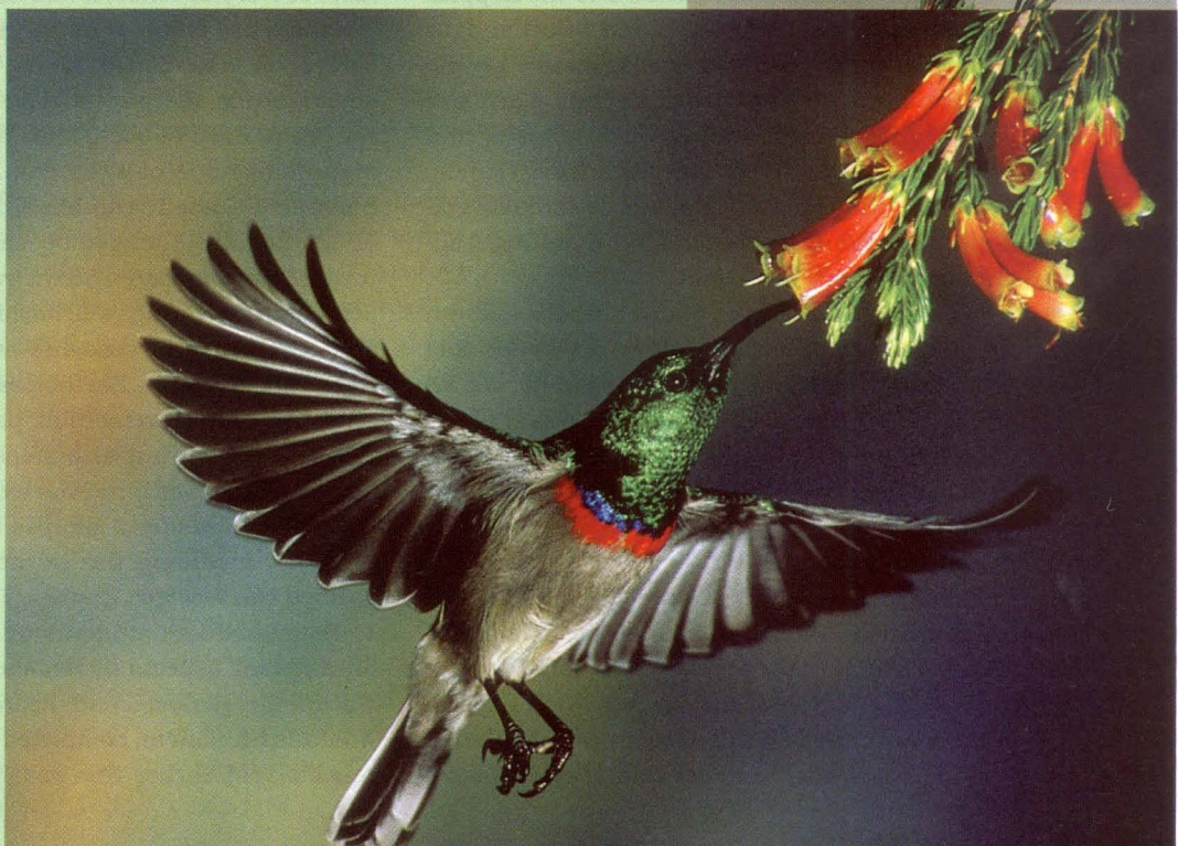
RIGHT: A lesser double-collared sunbird hovers beneath Erica versicolor flowers arranged in such a way that it could not alight to feed.