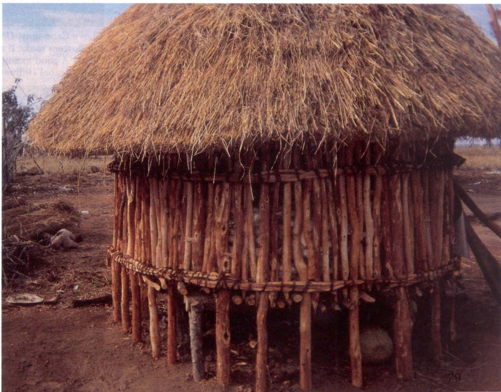
A grain store made from 86 mopane poles.