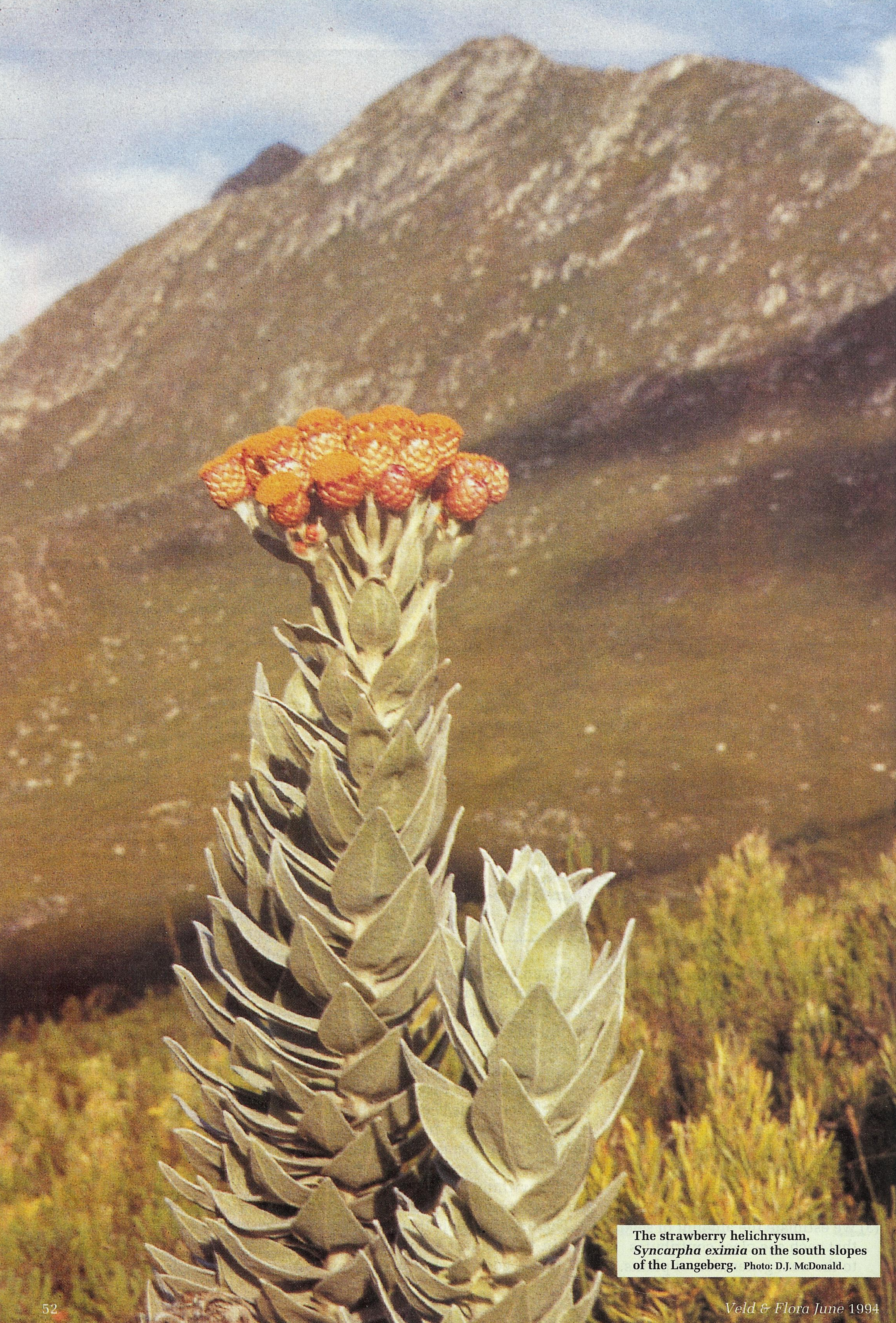
The strawberry helichrysum, Syncarpha eximia on the south slopes of the Langeberg.