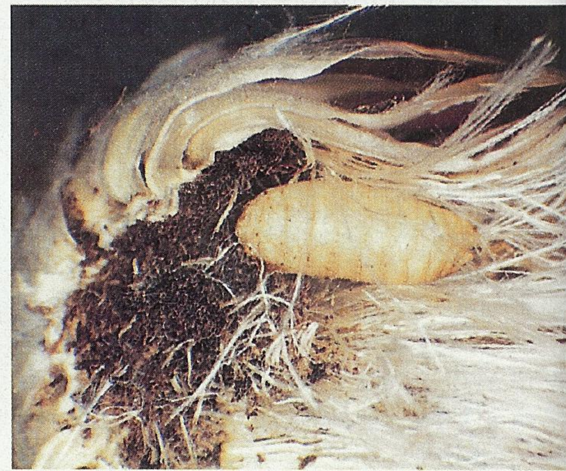
Above. Open inflorescence of Syncarpha eximia showing a puparium of the fruit fly, Craspedoxantha marginalis and the frass (excrement) from the larva which totally destroyed the seeds.

Unofficial records indicate that approximately 50 000 stems of Syncarpha eximia were harvested in 1988 whereas in 1993 only about 1 000 – 1 500 stems were harvested. This could be inter-